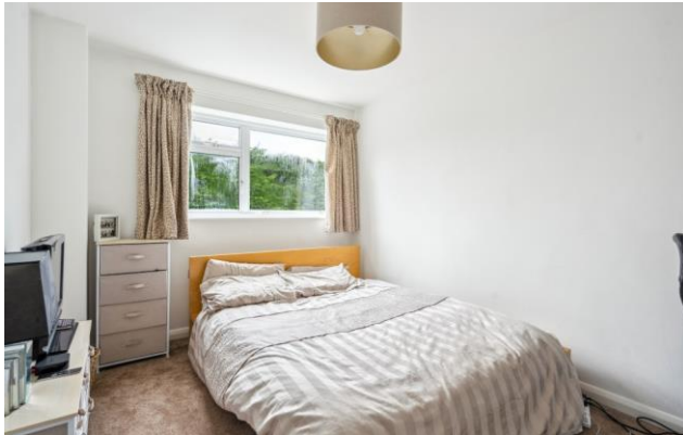
BEDROOM TWO double wardrobe, radiator.