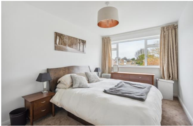
BEDROOM ONE double wardrobe, radiator, window with view over garden to central green.