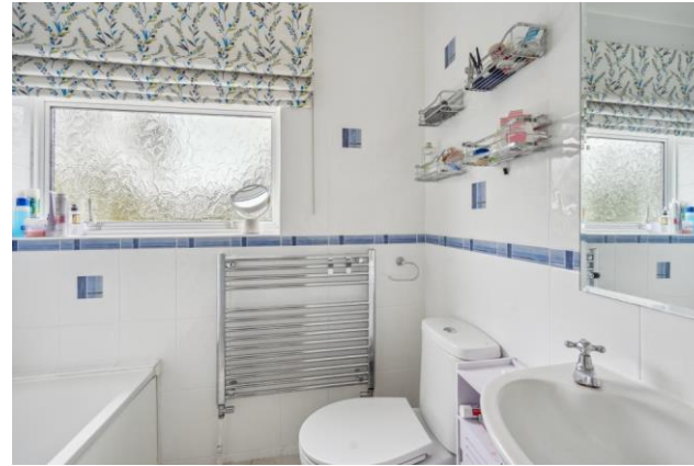
BATHROOM refitted white suite of low level w.c., wash basin with vanity cupboard, bath with shower screen and separate shower unit, extractor fan, heated towel rail, tiled walls and floor.